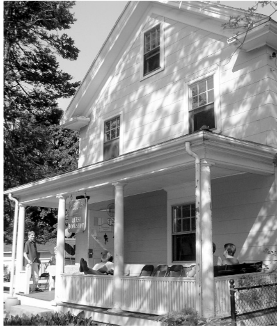
Theosophical Society Main Building